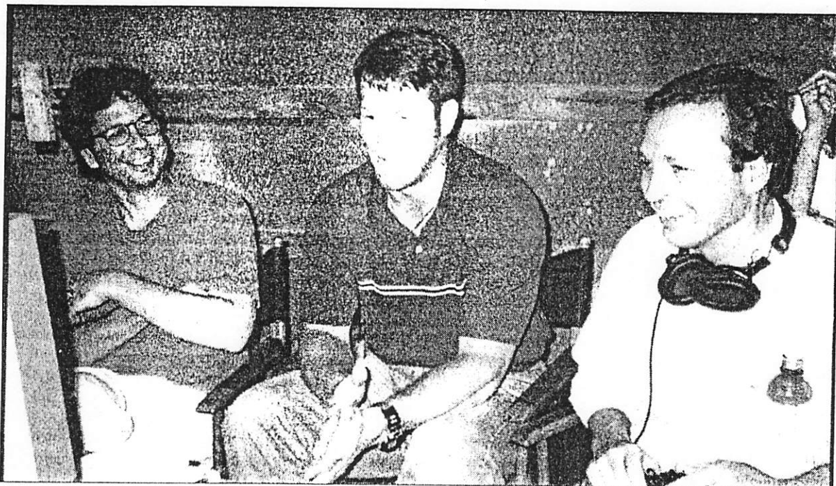
Actor and Greenbay Packers' quarterback Brett Favre is flanked by "There's Something About Mary" co-directors Peter (left) and Bobby Farrelly at daily rushes.